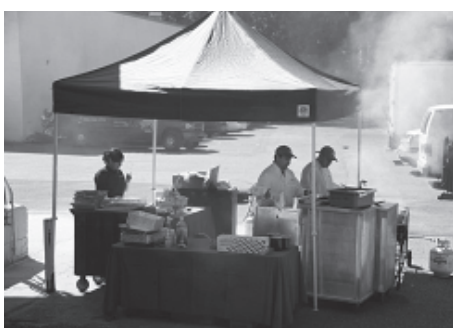
The Great American BBQ Co. cooked up a great lunch