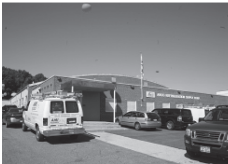
An outdoor view of the 30,000 square foot building in White Plains