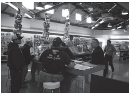
A busy day at the counter