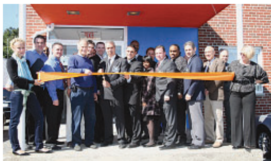
ABCO staff members ready for the ribbon cutting ceremony

Opens First Authorized Mitsubishi Electric Training Facility in Tri-State Area