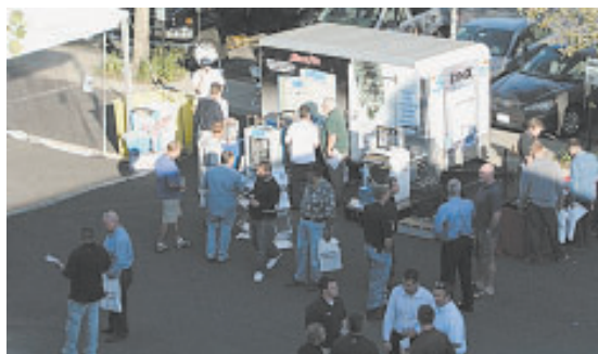
Views of the many outdoor exhibits

On September 23rd Slant/Fin conducted its very first High Efficiency Expo. The show ran from 4pm to 7pm and featured seminars by Carlin, Beckett and Honeywell. The evening was capped off by their featured speaker Dan Holohan. Contractors were treated to plant continued on page 10B