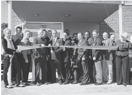
ABCO staff members ready for the ribbon cutting ceremony