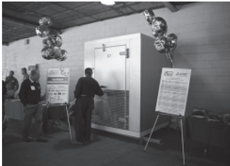
A Harford walk-in on display

States. Committed to exceeding each customer's highest expectations for 60 years, this family-owned business provides the most comprehensive customer care available. With 16 convenient locations in all five boroughs of New York City as well as Nassau, Suffolk, Westchester, and Rockland Counties, Connecticut, Boston, Philadelphia, New Jersey and Wilmington DE, the team at ABCO Refrigeration features highly-trained inside and outside sales representatives together with on-staff applications engineers and technical service specialists. This team of dedicated customer service experts is supported by one of the most disciplined operations teams in the HVAC/R wholesale distribution industry together with one of the largest HVAC/R inventories available. With one of the industry's largest fleets of delivery trucks and a 90,000 square foot distribution center that is prepared to operate 24 hours per day to meet our customers' requirements, ABCO Refrigeration is committed to providing the fastest order fulfillment possible. For more information, visit www.AbcoRefrigeration.com . ■