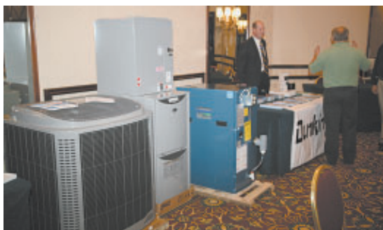
Tempstar and Dunkirk equipment on display

Sid Harvey's recently sponsored a one day seminar that provided a bare-bones overview of how today's energy challenges - if understood, can allow Heating / AC Contractors to prosper in the face of rising oil prices, legislative mandates and various rebate opportunities. The event was held at the Melville Marriott. continued on page 4B