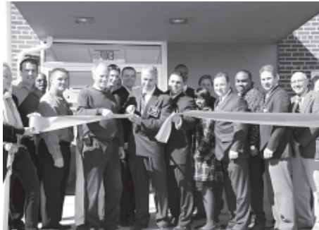
ABCO staff members take part in the ribbon cutting ceremony