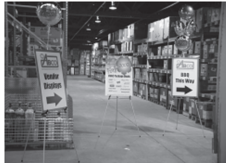
Views of the enormous warehouse at this branch