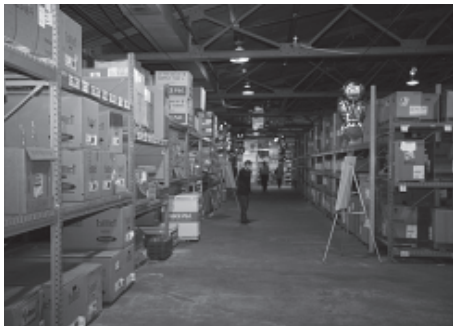
Views of the enormous warehouse at this branch