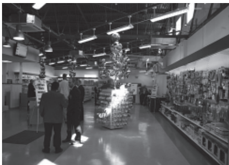
Views of the self serve area and counter.