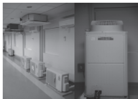
City Multi and split ductless equipment on display in the Mitsubishi Training Center in the White Plains branch.